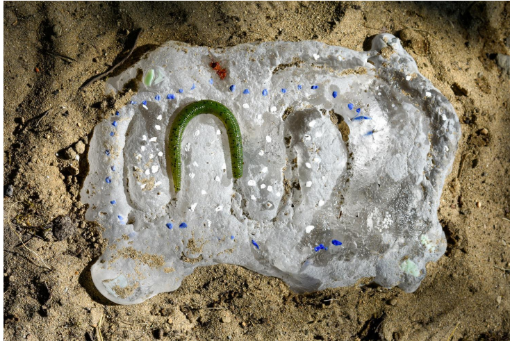
Fish Tube by Sasha Fishman, photo credit: Sasha Fishman